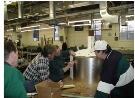
Scenes from last years lagging and sheeting class.

It's your training center...put it to good use!