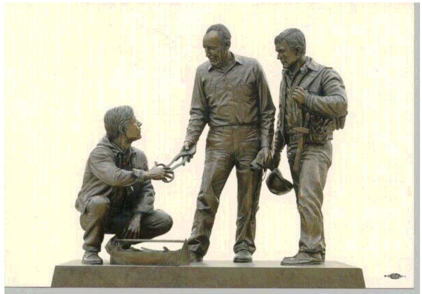
Knowledge is never lost if it is passed on.

WORK RECORDS ARE VITAL TO DOCUMENT YOUR EDUCATION...TURN THEM IN ON TIME!!!